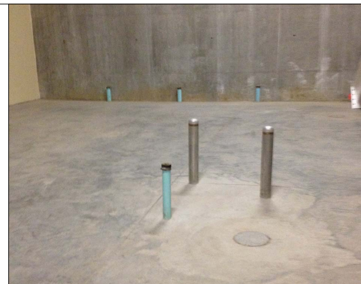
M8 TYPICAL PIPES TO BE CAPPED AND FLOOR DRAIN TO BE LEVELLED AD1.0 SCALE: 1/8" = 1'-0"