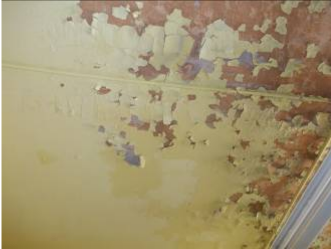
XRF Shot #170, Light Yellow Plaster Ceiling, Northwest Office