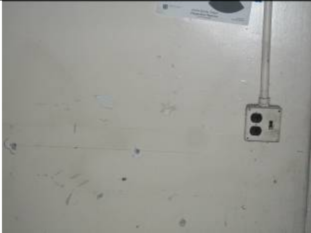
XRF Shot #144, Brown Plaster Wall, Side C, Southwest Men's Restroom