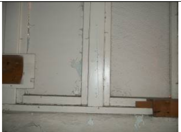
XRF Shot #155, Brown Wood Window, Side B, Southwest Women's Restroom