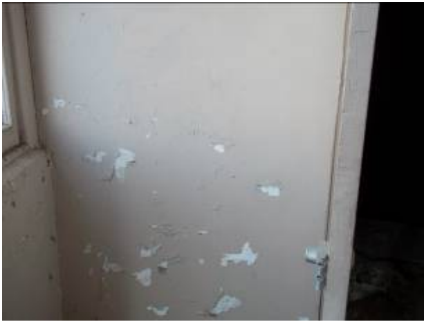
XRF Shot #141, Brown Concrete Wall, Side B, Southwest Entry