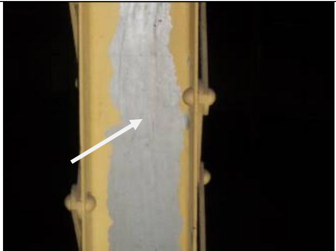
XRF Shot #188, Silver Metal Beam, Side B, 2 nd Floor Main Area

Photographic Documentation Industrial Arts Building State Fair Park Lincoln, Nebraska Photographs Taken on June 29, 2012