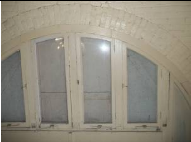
XRF Shot #184, White Wood Window, Side A, 2 nd Floor Main Area