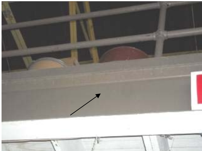
XRF Shot #190, Brown Metal Beam, Side C, Main Area