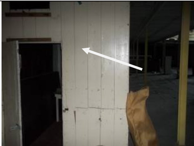
XRF Shot #167, White Wood Wall, Side A, Middle East Storage