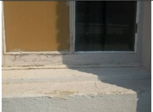
XRF Shot #200, White Wood Window, Side C, Exterior