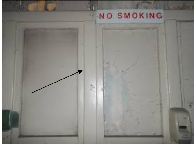
XRF Shot #151, Brown Wood Window Casing, Side D, Southwest Men's Restroom