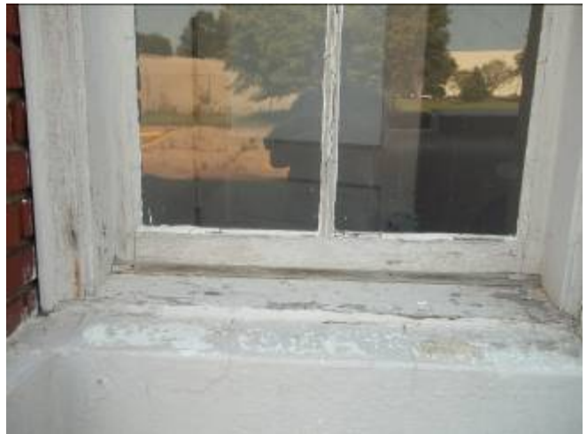
XRF Shot #196, White Wood Window, Side D, Exterior