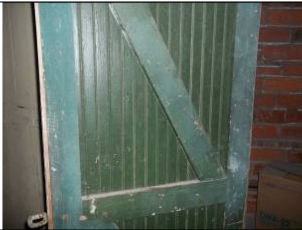
XRF Shot #164, Green Wood Door, Side B, Southwest Storage