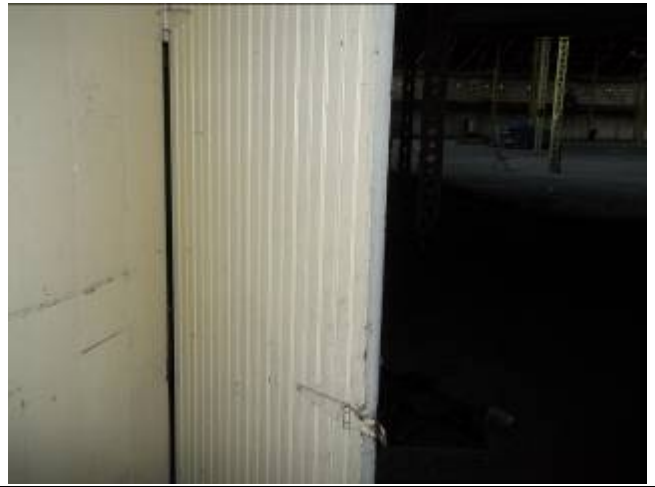
XRF Shot #163, White Wood Door, Side B, Southwest Storage