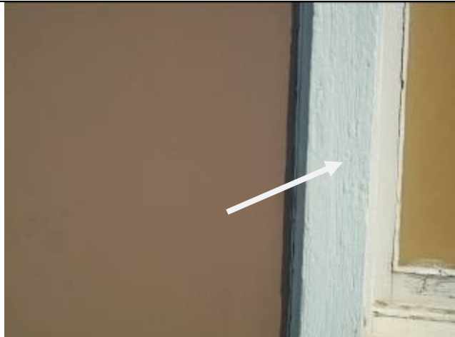
XRF Shot #199, White Wood Door Casing, Side C, Exterior