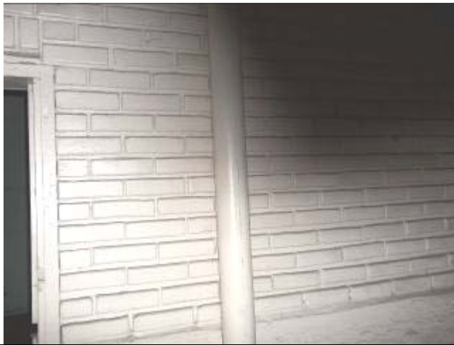
XRF Shot #162, White Metal Pipe, Side A, Southwest Women's Restroom