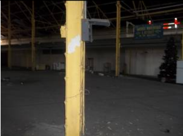
XRF Shot #177, Yellow Support Beam, Main Area