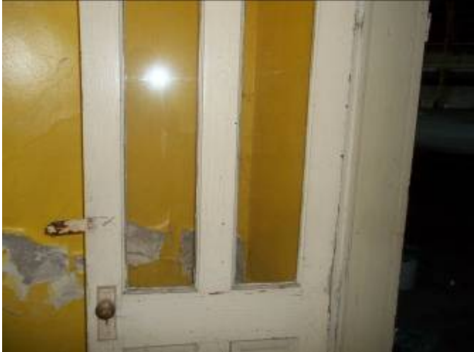
XRF Shot #171, White Wood Door, Side B, Northwest Office