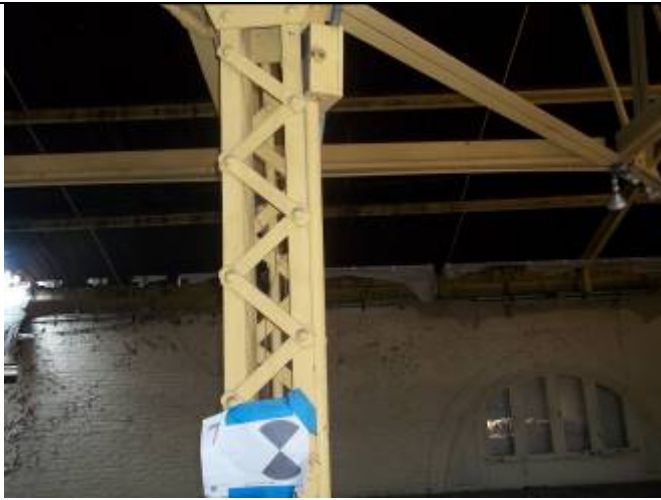
XRF Shot #185, Yellow Metal Beam, Side A, 2 nd Floor Main Area