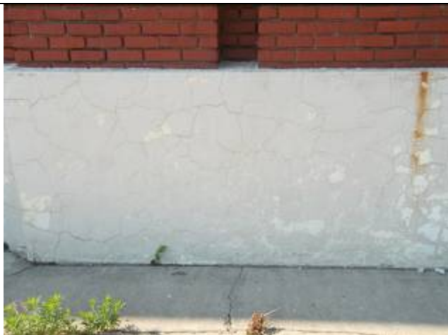
XRF Shot #210 and 211, White Concrete Wall, Side A, Exterior