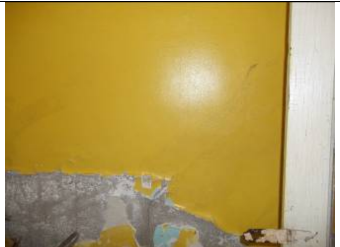
XRF Shot #169, Yellow Plaster Wall, Side B, Northwest Office

Photographic Documentation Industrial Arts Building State Fair Park Lincoln, Nebraska Photographs Taken on June 29, 2012