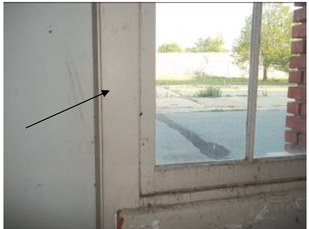
XRF Shot #143, Brown Wood Window Casing, Side D, Southwest Entry