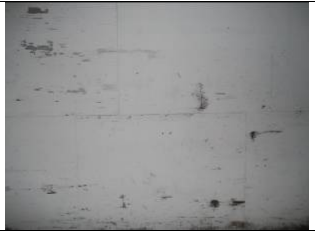
XRF Shot #165, White Wood Wall, Side A, East 1 st Garage Area