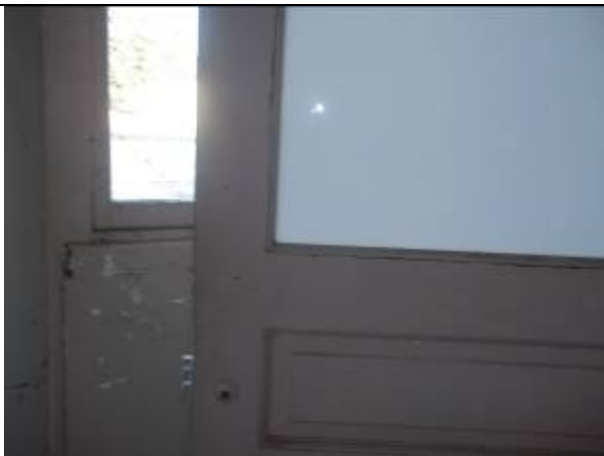
XRF Shot #152, Brown Wood Door, Side C, Southwest Men's Restroom